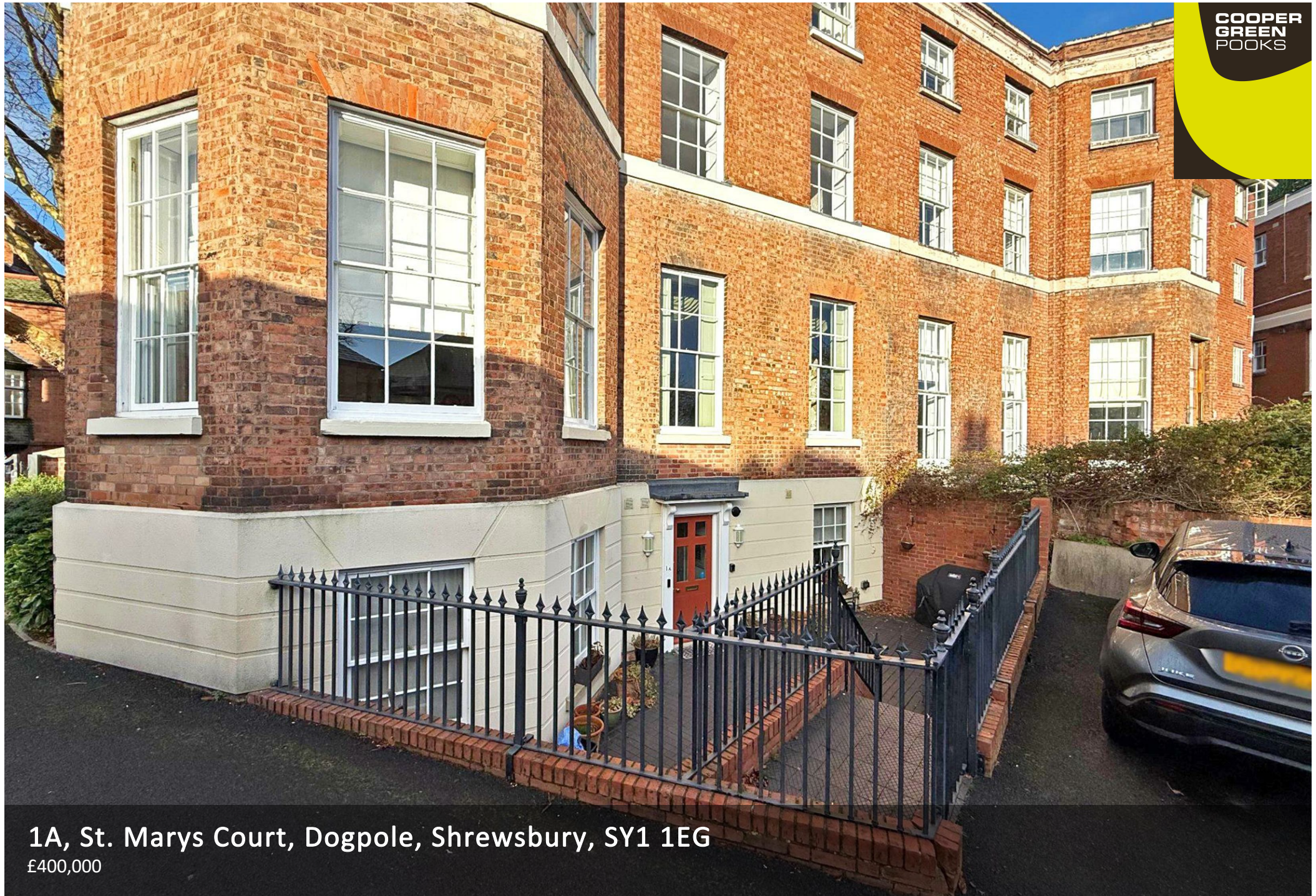
1A, St. Marys Court, Dogpole, Shrewsbury, SY1 1EG £400,000